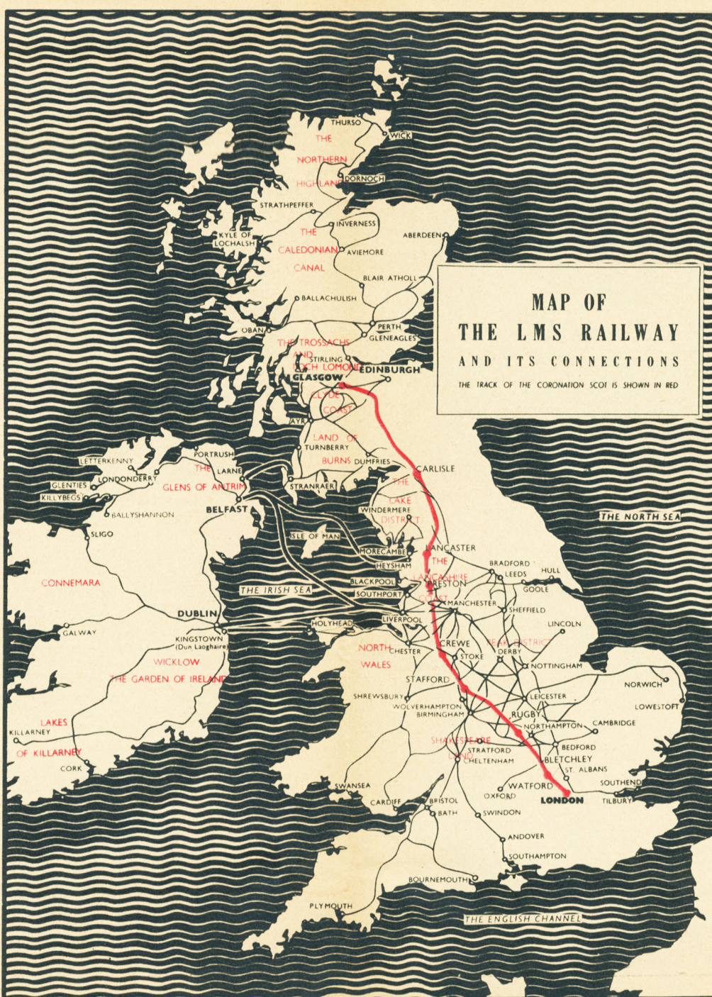
E. R. O. 53564/1. Neo Gravure Co. New York and Chicago