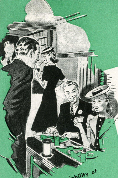
Enjoy the easy sociability of New Haven Grill Cars.