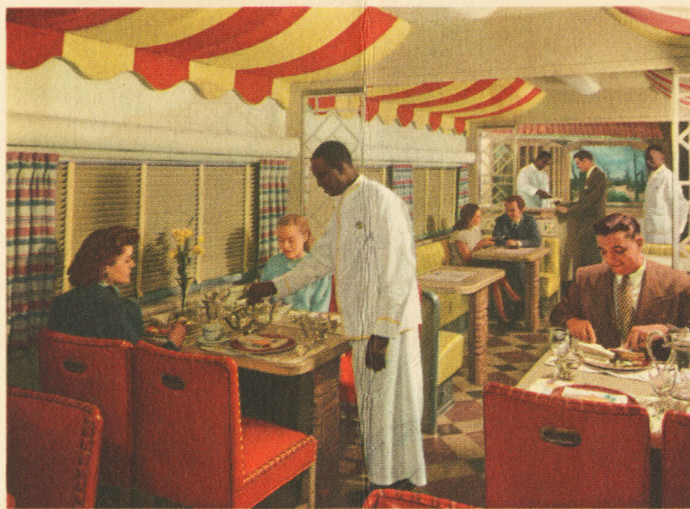
Refreshment headquarters for all passengers—particularly coach patrons