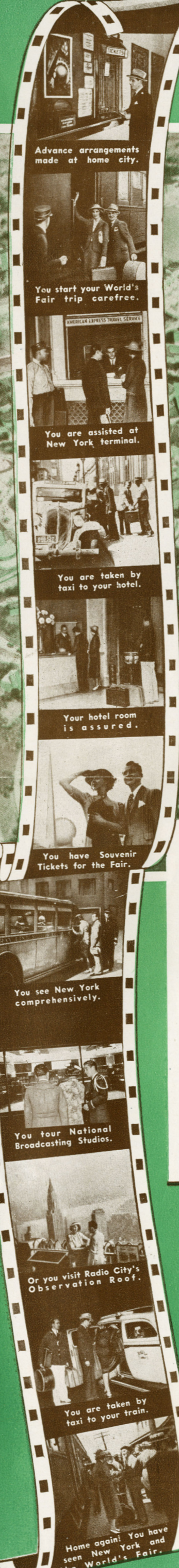
Advance arrangements made at home city.