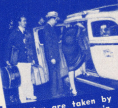
You are taken by taxi to your train.