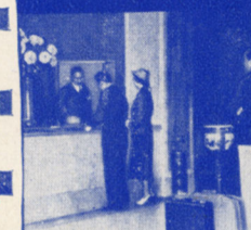
Your hotel room is assured.