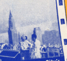
Or you visit Radio City's Observation Roof.