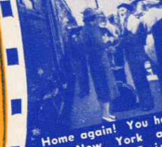
Home again! You have seen New York and the World's Fair.