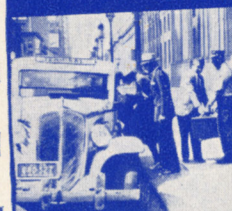
You are taken by taxi to your hotel.