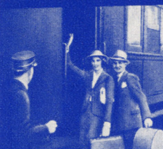
You start your World's Fair trip carefree.