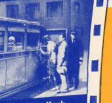
You see New York comprehensively.