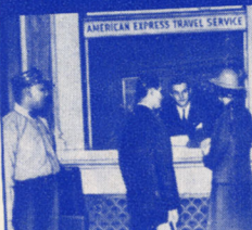
You are assisted at New York terminal.