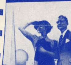
You have Souvenir Tickets for the Fair.