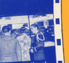
You tour National Broadcasting Studios.